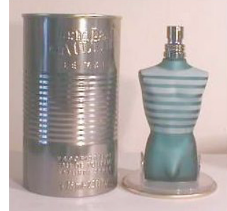
Figure 4. Gaultier's le male perfume bottle.

The third kind of anthropomorphic form is the anthropomorphic form of character . The anthropomorphic form of character imitates the traits, roles or functions of people. It also emphasizes the purpose of individual action. The display of qualities or habits that define and describe individuals are evidence of the anthropomorphic form of character. It draws from knowledge of societal conventions and contexts and reflects the practices people engage in. An example of the anthropomorphic form of character is the Jean-Paul Gaultier “Le Male” perfume bottle (see figure 4). Although the bottle contains elements of structural and gestural anthropomorphic form, taken as a whole it is an anthropomorphic form of character. It is not only a man in a certain style of dress, it is a type of person with specific traits. The erotically charged form of the bottle depicts male sexuality, and captures one way male sexuality is socially construed.