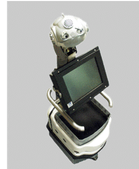
Figure 5. Pearl the robot

anthropomorphic form. An issue for designers of robots such as Pearl is understanding how the different kinds of anthropomorphic forms can be used effectively and integrated into a whole product form.