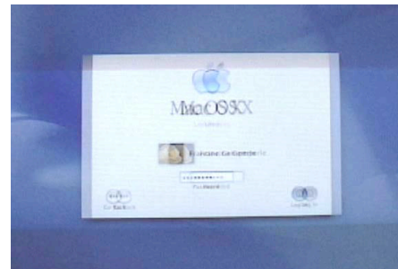
Figure 3. Mac OS 10.2 login screen shaking.

The next kind of anthropomorphic form is gestural anthropomorphic form . Gestural anthropomorphic form imitates the ways people communicate with and through the human body with a focus on human behavior. The use of motions or poses that suggest human action to express meaning, intention, or instruction is evidence of gestural anthropomorphic form. It draws from knowledge of human non-verbal communication and reflects the expressiveness of the human body. An example of gestural anthropomorphic form is the feedback provided from a Macintosh OS X login screen (see figure 3). This screen has a rectangular window with a text entry field for users to enter their password. When a user enters an incorrect password, the window quickly and briefly shakes from side to side – a common human gesture to express “no”. This action tells the user that the password entered was incorrect with a very gentle suggestion, imitating a human head-shake.