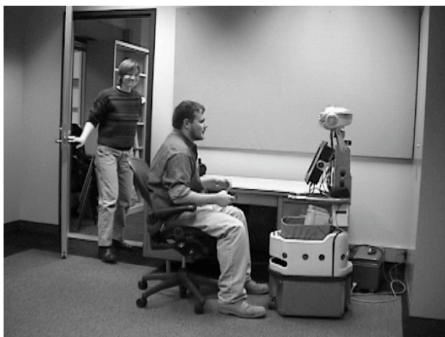
Figure 2. Robot and participant.

Twenty-one participants were randomly assigned to interact with either the serious (n = 11) or the playful (n = 10) robot. Participants averaged 25 years old. There were 9 females and 13 males. (We report only results from native English speakers because nonnative speakers frequently failed to understand the robot's simulated speech.)